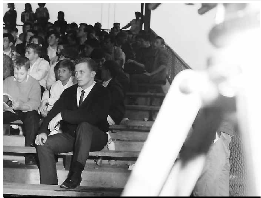
I didn't remember being there, but cinéma vérité proves I was.